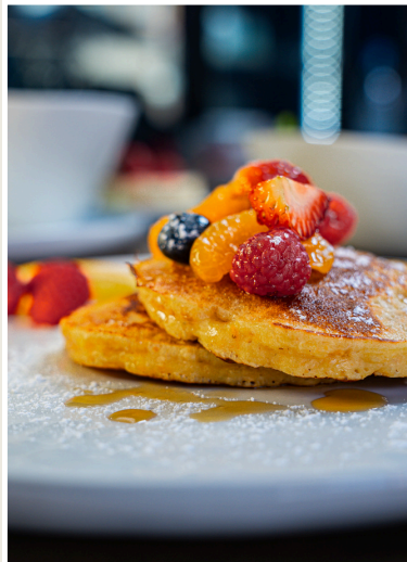
Orange Granola Pancake